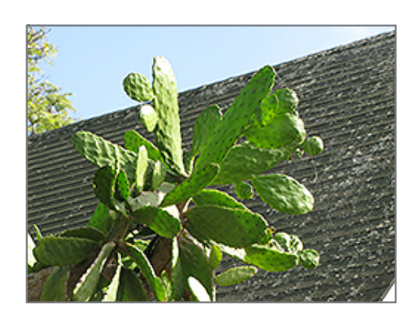
Road Kill Cactus foliage

Road Kill Cactus is a member of the cactus family, which are grown primarily for their characteristic shapes, their interesting features and textures, and their high tolerance for hot, dry growing environments. As an 'opuntiad' type of cactus, it doesn't actually have leaves, but rather modified succulent stems that comprise the bulk of the plant, and which are designed to retain water for long periods of time. This particular cactus is valued for its upright and spreading habit of growth on a plant consisting of spiny emerald green segmented pads that form 'branches' which spread out from a central base. This plant has double yellow cup-shaped flowers at the ends of the branches in early summer, which are interesting on close inspection. It features an abundance of magnificent red berries from early to late fall.