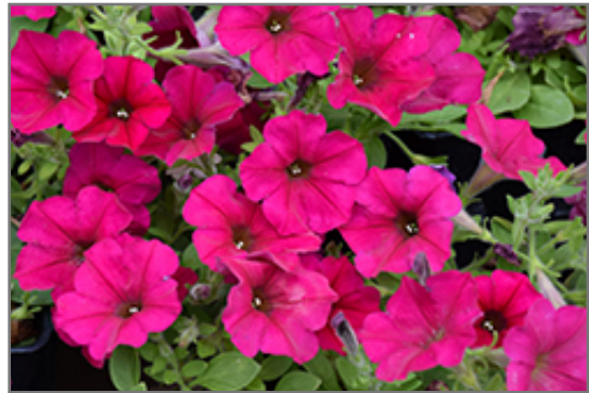
Wave Carmine Velour Petunia flowers

This plant will require occasional maintenance and upkeep. Trim off the flower heads after they fade and die to encourage more blooms late into the season. It is a good choice for attracting hummingbirds to your yard, but is not particularly attractive to deer who tend to leave it alone in favor of tastier treats. It has no significant negative characteristics.