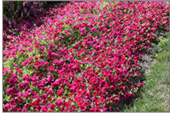
Wave Carmine Velour Petunia in bloom

Wave Carmine Velour Petunia will grow to be about 7 inches tall at maturity, with a spread of 3 feet. When grown in masses or used as a bedding plant, individual plants should be spaced approximately 24 inches apart. Its foliage tends to remain low and dense right to the ground. This fast-growing annual will normally live for one full growing season, needing replacement the following year.