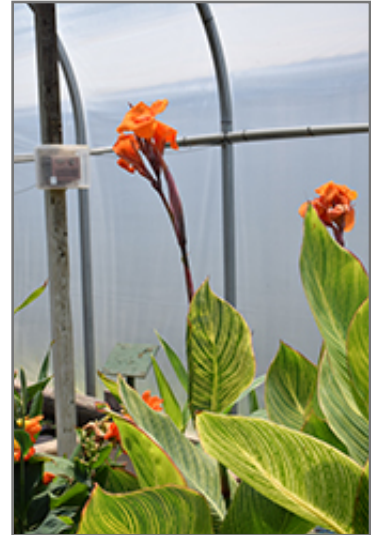
Bengal Tiger Canna flowers

This plant should only be grown in full sunlight. It requires an evenly moist well-drained soil for optimal growth, but will die in standing water. It is not particular as to soil pH, but grows best in rich soils. It is highly tolerant of urban pollution and will even thrive in inner city environments, and will benefit from being planted in a relatively sheltered location. Consider applying a thick mulch around the root zone in winter to protect it in exposed locations or colder microclimates. This particular variety is an interspecific hybrid. It can be propagated by division; however, as a cultivated variety, be aware that it may be subject to certain restrictions or prohibitions on propagation.