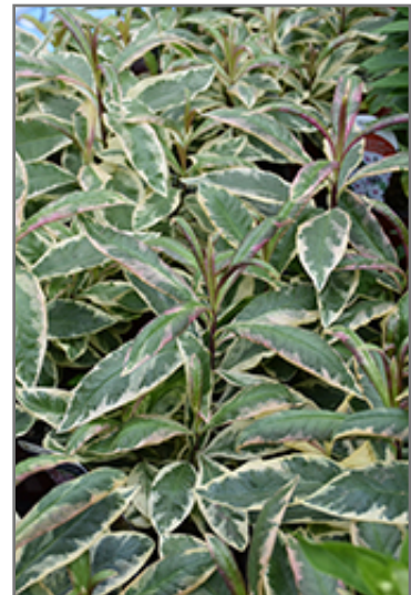
Olympus Garden Phlox foliage