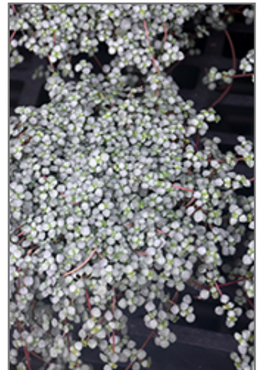
Aquamarine Pilea foliage