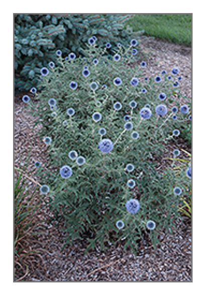
Blue Glow Globe Thistle in bloom