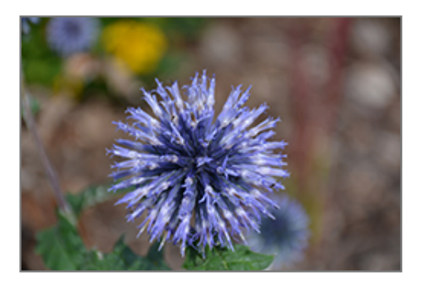
Blue Glow Globe Thistle flowers

Blue Glow Globe Thistle will grow to be about 3 feet tall at maturity extending to 4 feet tall with the flowers, with a spread of 24 inches. The flower stalks can be weak and so it may require staking in exposed sites or excessively rich soils. It grows at a fast rate, and under ideal conditions can be expected to live for approximately 10 years. As an herbaceous perennial, this plant will usually die back to the crown each winter, and will regrow from the base each spring. Be careful not to disturb the crown in late winter when it may not be readily seen!