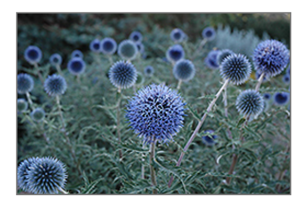
Blue Glow Globe Thistle flowers

Blue Glow Globe Thistle is recommended for the following landscape applications;